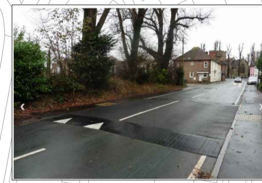
EXISTING LOW ROAD HUMP/PAINTED ROAD HUMP TO BE REMOVED AND 100mm RAISED ROAD TABLE TO BE PROPOSED