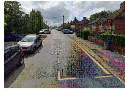
SPEED CUSHION IN VICINITY OF EXISTING BUS STOP