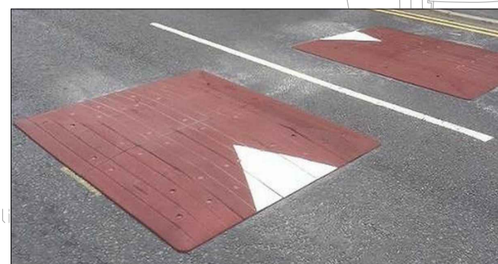
75mm SPEED CUSHIONS TO BE PROPOSED AT 70m INTERVAL