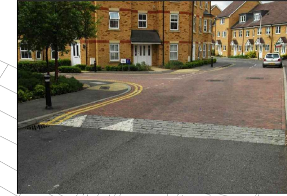
PROPOSED TABLE TOP JUNCTION WITH UNCONTROLLED PEDESTRIAN CROSSING FACILITIES