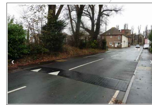
PROPOSED 100mm High RAISED TABLE WITH MINIMUM OF 6m LONG PLATEAU (DUE TO BUS MOVEMENT)