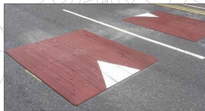
75mm High SPEED CUSHION TO BE PROPOSED