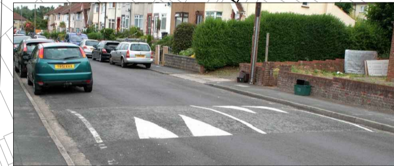
EXISTING ROAD HUMP TO BE REMOVED & NEW 100mm HIGH ROUND ROAD HUMPS TO BE PROVIDED