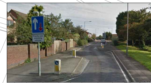
PROPOSED CHICANE TO BE PROVIDED