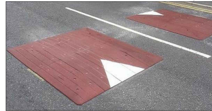
75mm High SPEED CUSHIONS TO BE PROPOSED AT 50m INTERVAL